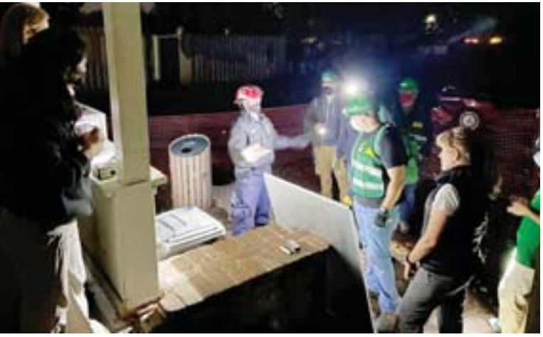
CERT members at a recent training session.